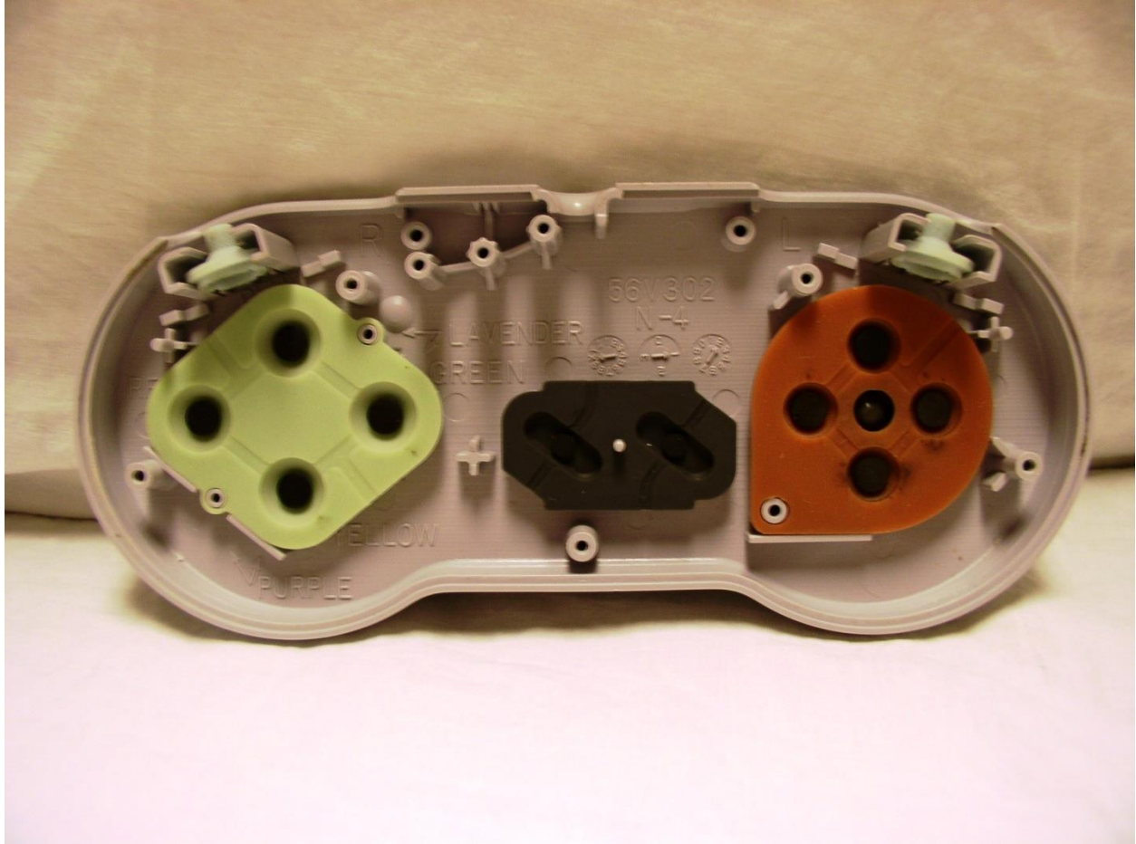
Picture Four- Mother board removed

Now your controller should look like that in Picture Four: