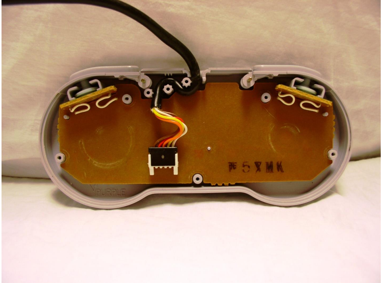
Picture Three- Inside of the Super Nintendo Controller

Your controller should now look like the one in Picture Three: